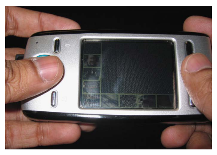
Fig. 3. The Motorola E680i running Mobiphos.

Our first version of the application kept all images at full resolution loaded in memory. This implementation worked well when testing the application on a desktop computer. However, the program become sluggish or unresponsive